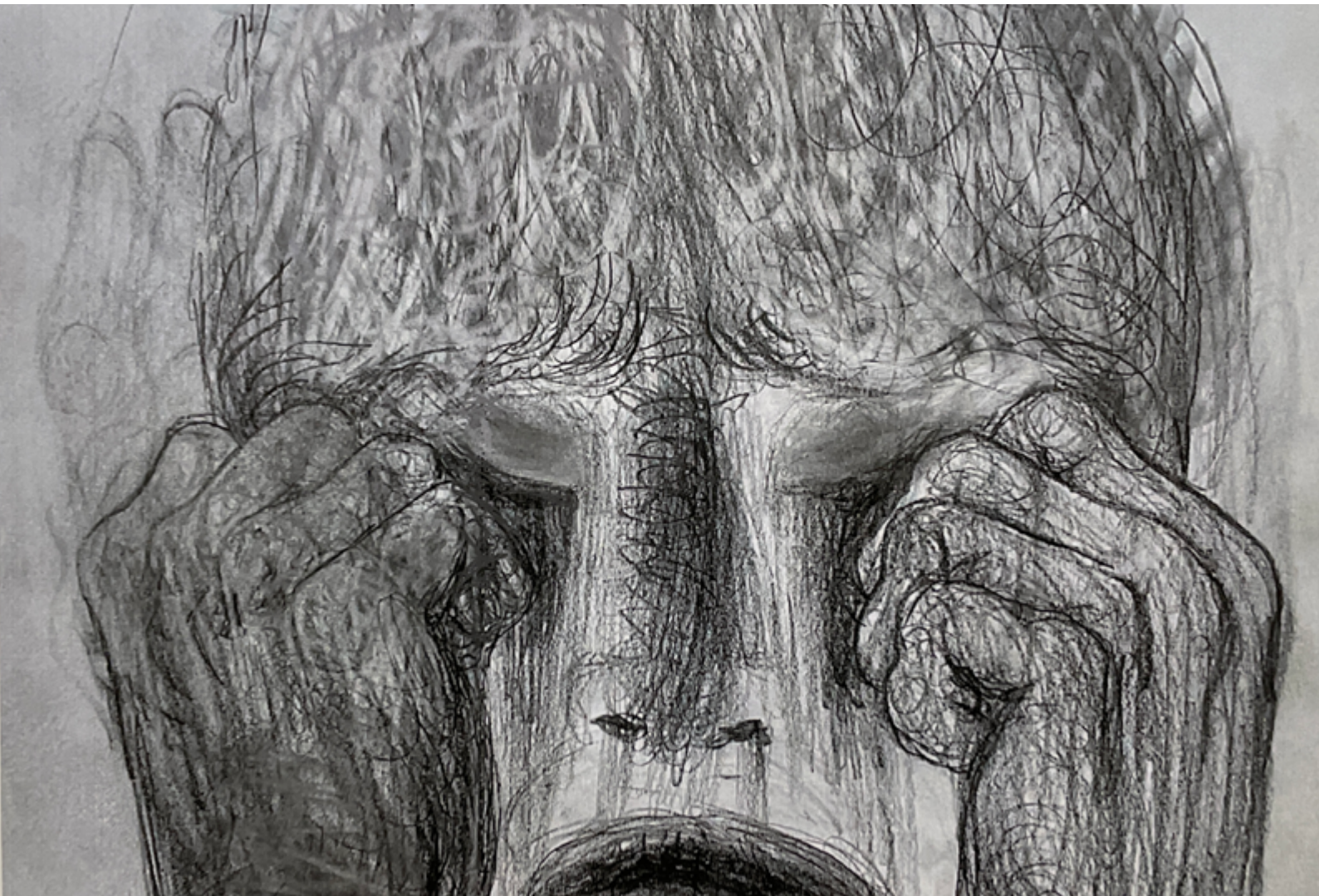
Miriam Cahn, o.t. , 21.2.24, 2024, copper etching, 3 elements, 1/3 : 29.5 x 24.4 cm, 2/3 : 32.7 x 32.8 cm, 3/3 : 30.3 x 45 cm, unique, courtesy of the artist, Galerie Jocelyn Wolff, Romainville and Meyer Riegger, Berlin/ Karlsruhe/Basel